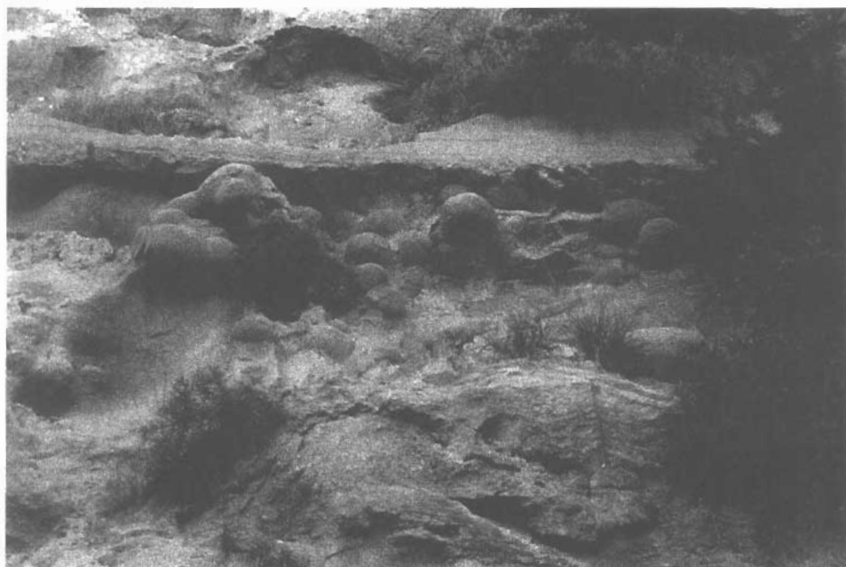
Fig. 3: The concretionary fluvial sandstone of Sykia section.

deposits represents high rates in shell production. These assemblages are formed during low sedimentation rates and have been reworked during repeated storm events.