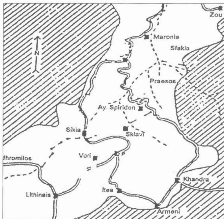
Fig. 1: The study area around Sykia section.

crude fining upward trends of individual units. The pebbly sandstones were probably deposited during waning flood stages.