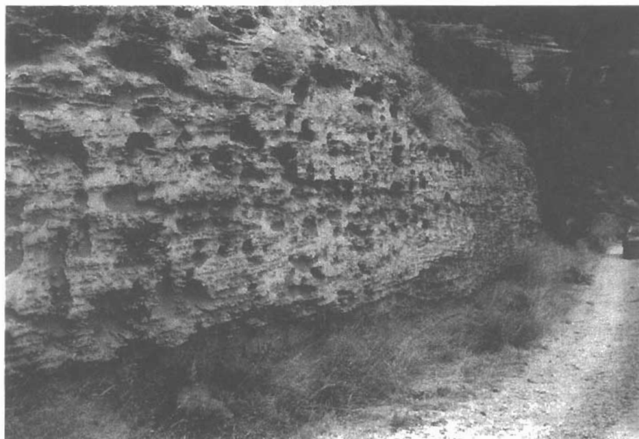
Fig. 4. Highly-elongated concretions in Lithinais area.

Highly elongated sandy concretions are found into loose sandy deposits along the trackroad in Lithinais valley (Fig. 4). Sands are fine to medium grained and cross-stratified. Scattered subrounded to rounded pebbles are forming lenses and pockets. In the basal part of the outcrop there is 25-30 cm of clast-supported stream-flow conglomerate similar with the one observed in Sykia section.