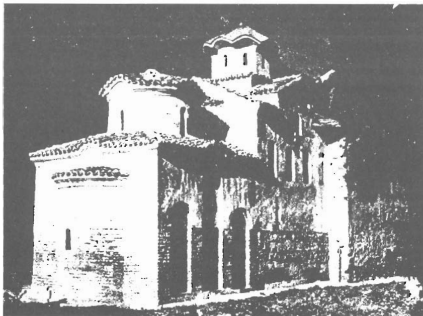
Fig. 3. The Boyana church (11 th - 13 th century A.D.)

The quality of the monument constructions is of significance for seismic effects. There are constructions that do not permit considerable deformation. The inner city castle, constructed mainly in the 4 th and the 6 th centuries, has exceptionally stable and large walls. The basements of this ancient castle are saved up our days. The seismic effects are not considerable.