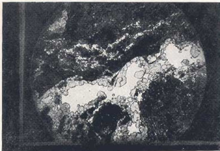
Fig. 5 ( \times 40 ). Serpentinized peridotite. A veinlet consisting of prehnite and rounded brucite cutting a garnet mass.