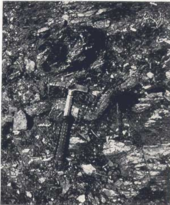
Fig. 3. Prophites Elias. Outcrop of mauve thin layers of manganese chert and spilites intercalated with limestones and states of flysch facies.