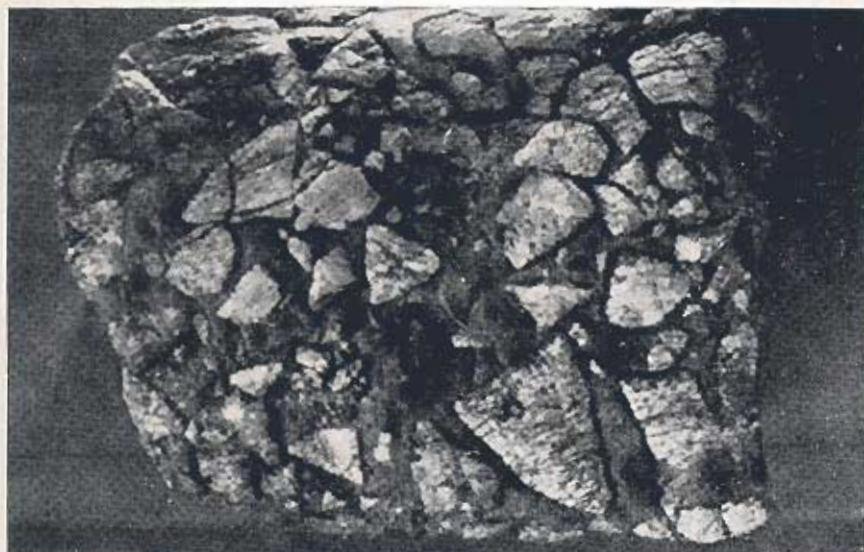
Fig. 2. Katavothra. Dolomitic conglomerate with calcitic cement material indicating the upper Cretaceous transgression.