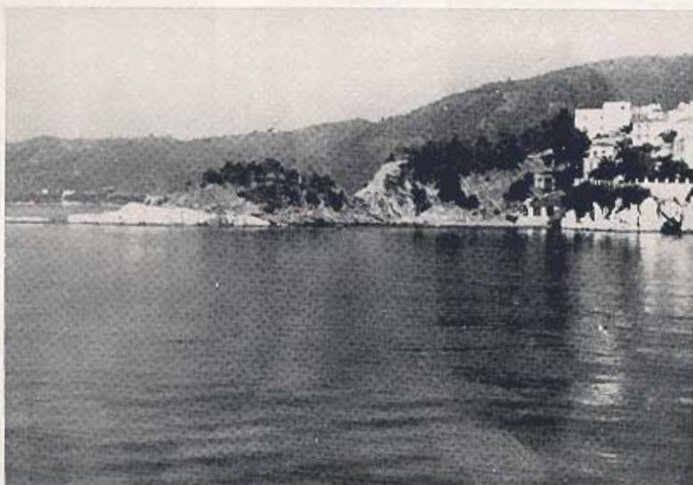
Fig. 1. Akra Plakes. Marbles of middle-upper Triassic age. They strike N-S and dip E-W, and are transgressively overlain by slates of flysch facies with fold axis striking E-W and dipping 20^\circ to the west.