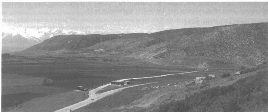
Fig. 3. View of the Hyambolis fault escarpment (fault Y2), and the erosional surfaces that constitute the top of the Pr. Elias Sfakos horst. The fortified hill of ancient Hyambolis is visible at the right hand side of the photograph.

this palaeo-relief (the 'Chlomon surface') extended into the area of Pr. Elias and Skarfi (the 'flat' hilltop of Skarfi is probably a remnant of this relief), so it can be utilised as a datum whose vertical displacements depict the deformation caused by the faults since its formation.