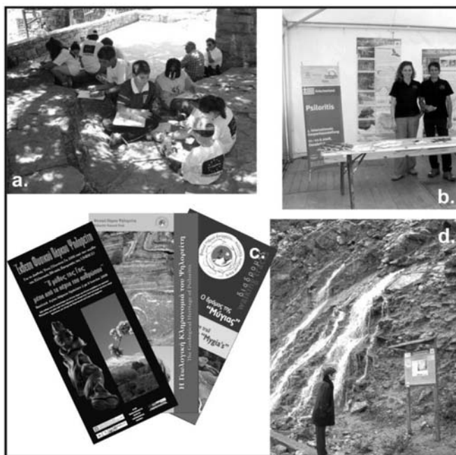
Fig. 4: Some of the activities of Psiloritis geopark. a) Educational field trips on biodiversity, b) Participation in the First International Geopark's fair in Germany, c) Various publications and promotional material, and d) Information panels.

tunities which have been created in tourist enterprises, small hotels, guest houses, restaurants and other activities connected with the increase of tourist flow in the geopark area. Several other local artisans, such as makers of handicrafts and ceramic fossil casts, carpenters, and blacksmiths, are permanent collaborators with the geopark.