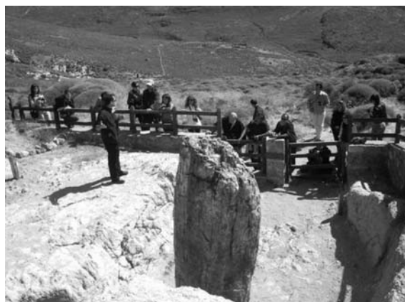
Fig. 2: Guided tour at the Lesvos Petrified Forest Geopark. More than 90.000 visitors every year visit the Museum and the open air parks.

protected area is included in the Natura 2000 network, basically due to the presence of the Petrified Forest, the high endemism of flora and fauna and the variety of natural habitats.