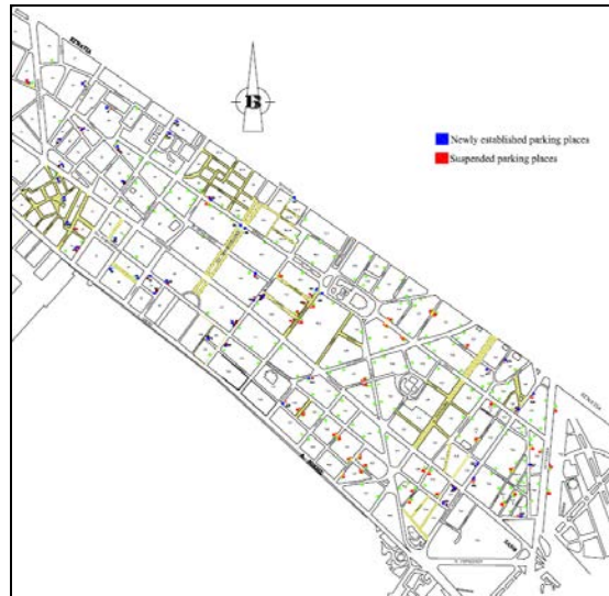
Figure 3. Locations of the suspended and newly established parking areas in 2013 compared to 2008 (S. Kakarakis, P. Brozos & A. Strouboulis, 2014)