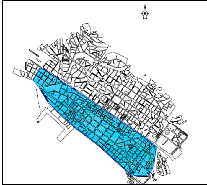
Figure 2: Southern sector of the study area

In the study area, 285 parking places for loading and unloading goods (76 parking places in the northern sector and 209 in the southern sector) were identified. Surveys took place in 155 parking places (145 with time restrictions and 10 with weight restrictions). In addition 79 questionnaires were filled by employers of the shops located in a buffer zone of 50 meters radius around each parking place (Basbas S. & Bouhouras E., 2012).