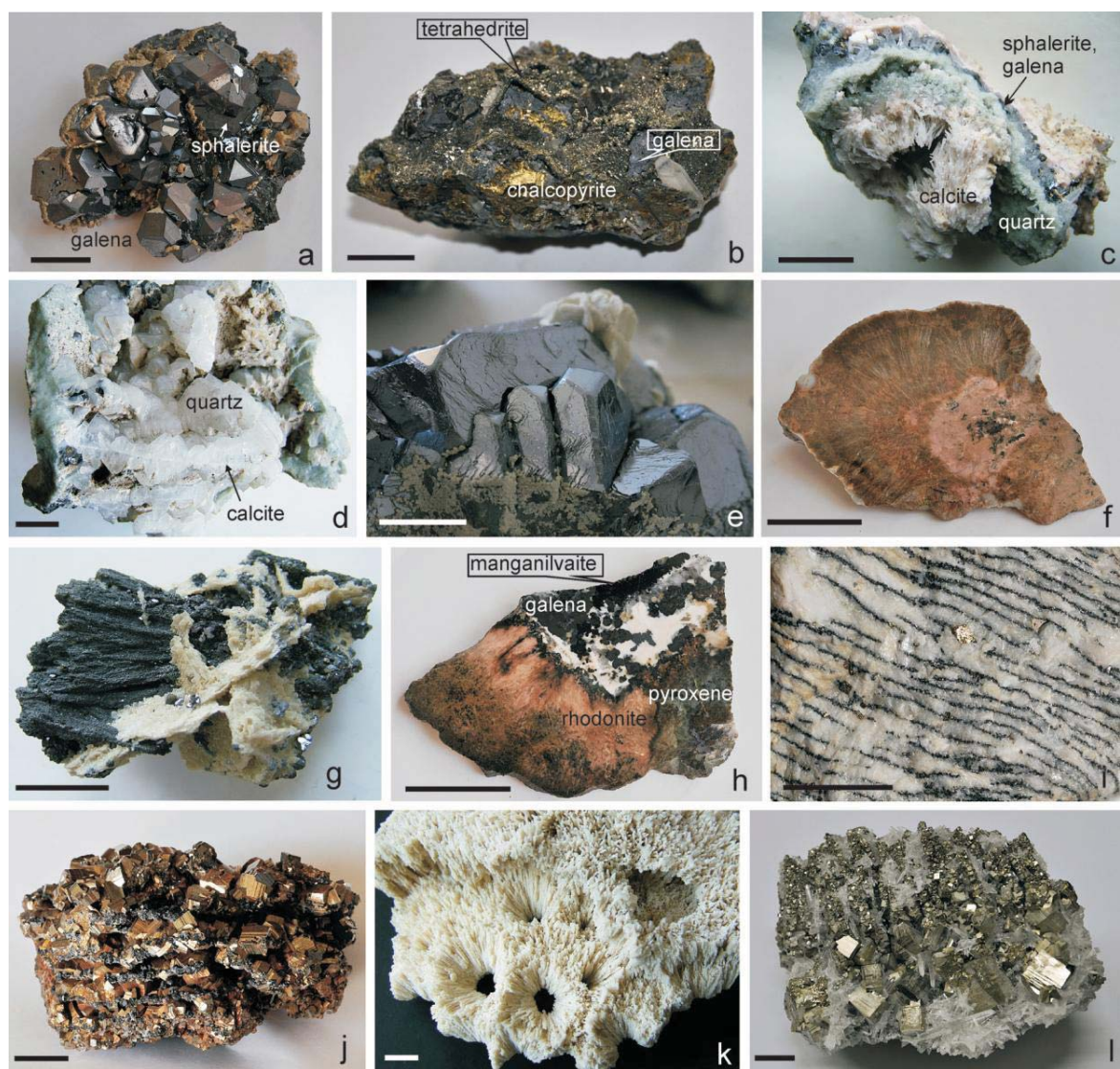
Fig. 2. Macro photographs of representative mineral textures from the Pb-Zn Madan deposits. a – galena-sphalerite druse; b – tetrahedrite crust over hydrothermally dissolved galena; c – peculiar concentric-zoned shell-like texture, resulting from “hydrothermal karst” after primary pyroxene aggregates; d – bilateral epitaxial growth of quartz over thin-platy calcite; e – dissolution forms of cubo-octahedral galena crystals; f – radiate skarn pyroxene-rhodonite aggregates; g – galena-sphalerite aggregate, inheriting the radial pyroxene texture; h – nests of manganilvaite, galena and sphalerite, carbonates and quartz in skarns; i – massive rhythmic-banded texture composed by galena and sphalerite in carbonate matrix; j – porous sphalerite and pyrite aposkarn rhythmities; k – conical, coral-like late fibrous Fe-Mn dolomite; l – pyrite pseudomorphs after altered skarns, with interstitial quartz. Scale bars refer to 2 cm.

Rare peculiar textures. In rare cases sphalerite and galena stalactites and tube-like textures can be observed, as well as ore ‘sands’ (loose grainy pyrite). Also, bilateral epitaxial (Fig. 2d) and autoepitaxial overgrowths and other mutual relationships are typical for the metasomatic textures.