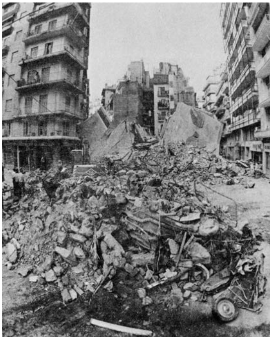
Figure 1. Building collapse in Thessaloniki after the 1978 earthquake

The result of this procedure was the creation of an enormous database from the inspection forms that contained classification of buildings, but also certain additional information on types of damage, structure and size of building, etc. After the completion of the inspections (approximately two months for the first and second degree inspection), roughly 63000 buildings in the region of Thessaloniki were inspected (corresponding to roughly 250000 apartments, offices and shops). All data were kept in the archives of the newly established Agency for the Relief of Seismic Catastrophes in Northern Greece. Table 1 shows an overview of the number of inspections and the results (Doukas 2003).