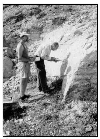
Figure 3, 4. Open limestone quarry from Slava Rusa, when carried out "in situ" tests

By comparing the results obtained for the compression strength with those subsequently determined by direct tests, the validity of the calculus relation was proved, the obtained mechanical resistances registering differences that can be included in the error tolerance limit. The correctness of the values of the longitudinal propagation velocity determined by the surface technique is verified, by comparing these values with the values of the propagation velocity measured with the direct transmission technique, insignificant differences existing between the two values