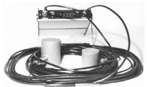
Figure 2. Sclerometer Schmidt type N, for acoustic (ultrasonic) measurements in the rocks

At the level of the technical standardization techniques - by the laboratories of the European Community - a series of processes and standards are being adopted for quality characterization and implicitly the field of application of the rocks using the parameter called Identification number.