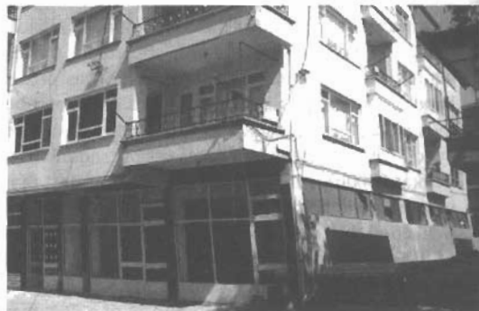
Fig. 6 Reinforced concrete frame structure in Yalova that displayed first story column-hinge deformation, but did not collapse (damage degree 4).