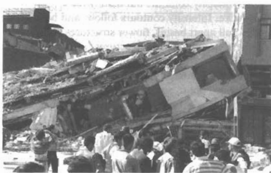
Fig. 4 Reinforced concrete frame structure that collapsed in Gölcök town (damage degree 5).

Ψηφιακή Βιβλιοθήκη "Θεόφραστος" - Τμήμα Γεωλογίας, Α.Π.Θ.