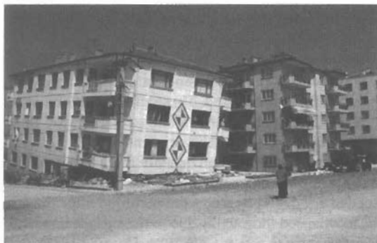
Fig. 5 Reinforced concrete frame structure that sustained collapse of ground floor in the area of Gölçök -Degirmendere (damage degree 5).