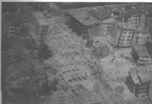
Fig. 3 Representative view of a portion of Adapazari that suffered total damage ( I_{EMS98} = XII ) after the 17 th August earthquake.