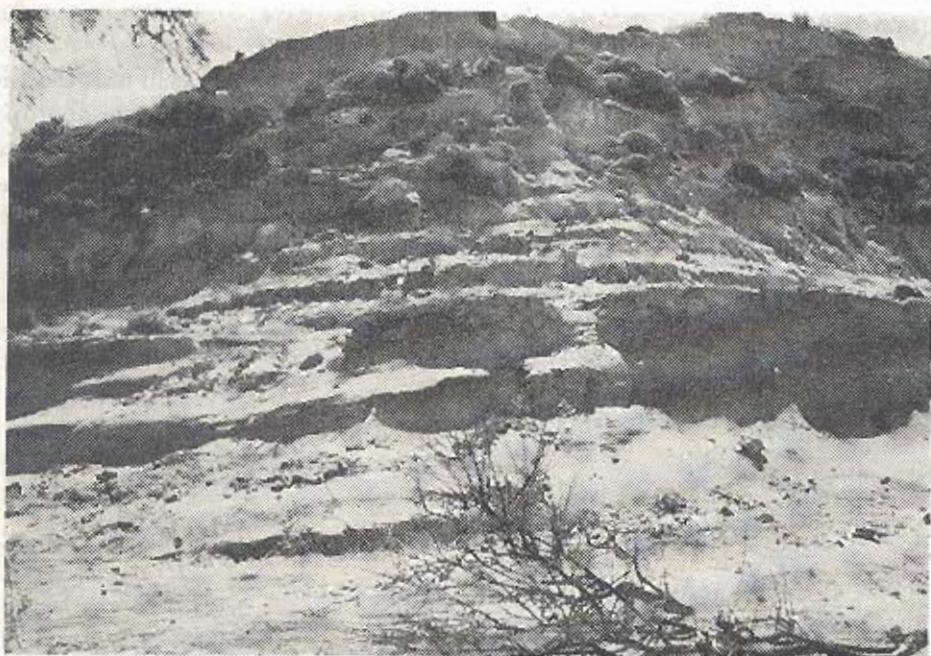
Fig. 2. A view of Psathi section.

In the section Psathi, sediments of the Kissamou formation are exposed (FREUDENTHAL, 1969). The main body of this formation consists of blue or purple amor-