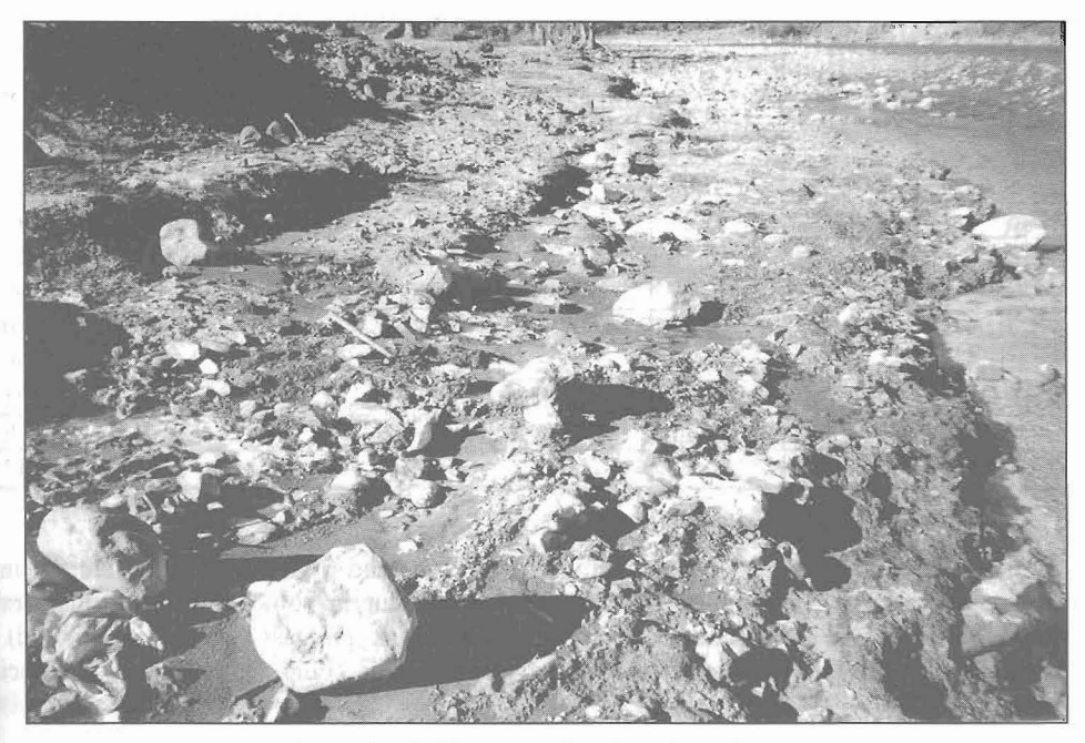
Figure 1 - Acid waters flowing from dump 1