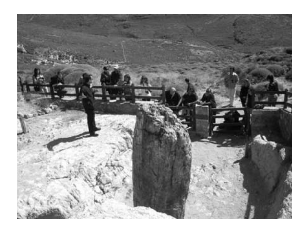
Fig. 2: Guided tour at the Lesvos Petrified Forest Geopark. More than 90.000 visitors every year visit the Museum and the open air parks.

protected area is included in the Natura 2000 network, basically due to the presence of the Petrified Forest, the high endemism of flora and fauna and the variety of natural habitats.