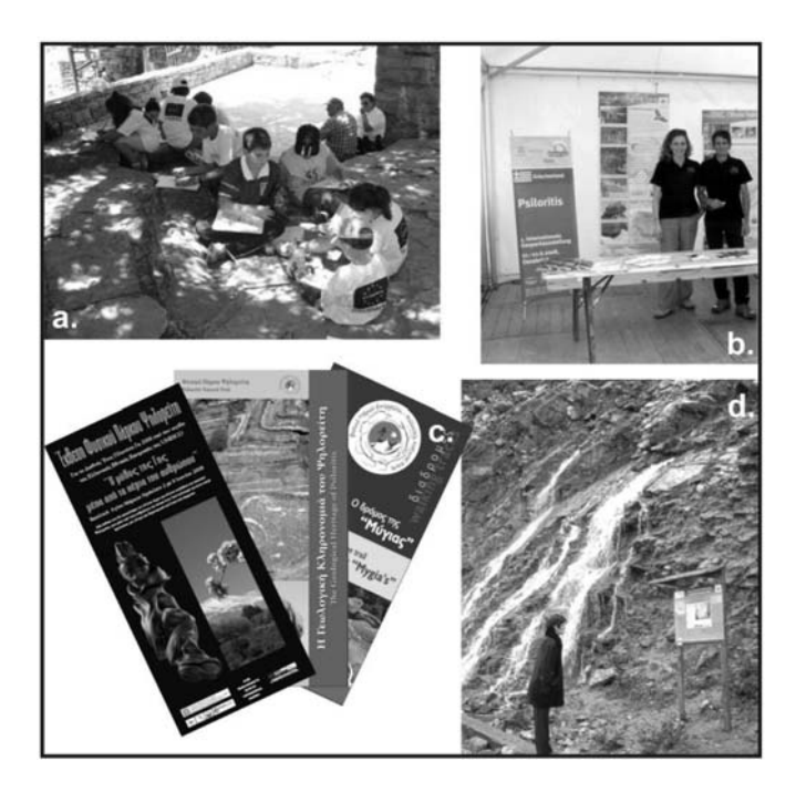
Fig. 4: Some of the activities of Psiloritis geopark. a) Educational field trips on biodiversityy, b) Participation in the First International Geopark's fair in Germany, c) Various publications and promotional material, and d) Information panels.

tunities which have been created in tourist enterprises, small hotels, guest houses, restaurants and other activities connected with the increase of tourist flow in the geopark area. Several other local artisans, such as makers of handicrafts and ceramic fossil casts, carpenters, and blacksmiths, are permanent collaborators with the geopark.