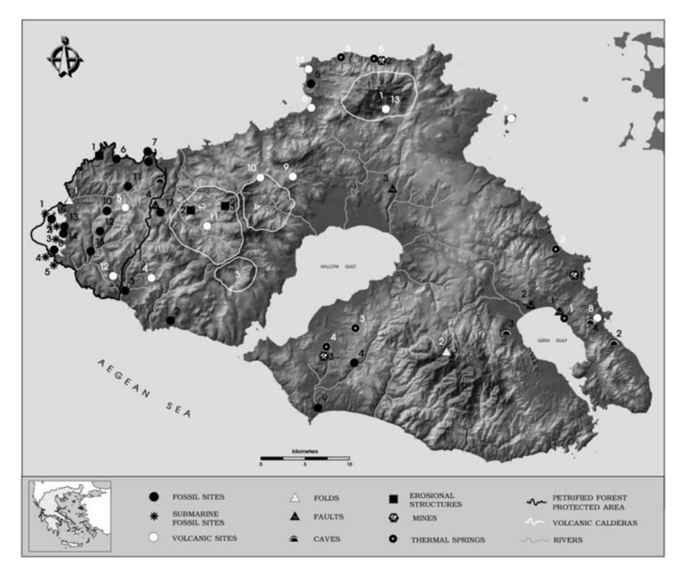
Fig. 1: Lesvos geopark and the main geosites.

economic activities. Hereby we examine the influence of certain activities and initiatives, developed so far in these geoparks, especially under the topics of scientific and educational progress, conservation of geological heritage and local, economic development.