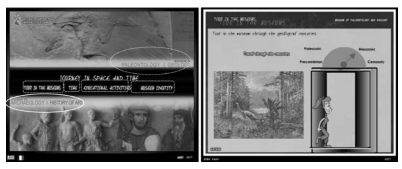
Fig. 2: "Journey in Time and Space": Virtual visit to the Museum of Geology and Palaeontology.

Every activity leads to a form of assessment of the user. There is also an evaluation activity as concerning the total of the educational activities for every level of education.