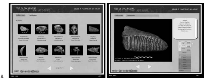
Fig. 3: (a): Activity based on digitalized palaeontological collections (vertebrates, invertebrates, plants); (b): Fossil's identity card.

b) Time: Geology is the science with the clear focus on deep time and on the procedures of retro diction. It is proposed that collective and individual grasp of deep time influences the quality of engagement with a host of broader matters, ranging from current environmental issues (e.g. sea-level change and coastal retreat) to longer-term matters (e.g. mass extinctions, asteroid impacts, periods of enhanced volcanic activity, evolution of the Universe). It is suggested that, if we have an insecure deep time framework, we will be less able to accommodate new learning of geosciences concepts with a strong (deep) temporal component. As both teachers and learners we will, therefore, tend to avoid such new knowl-