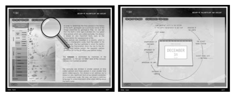
Fig. 4: Time's activities.