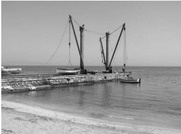
Fig. 2: The port of Moutsouna, where once emery was loaded into the barges.

expansion of cheaper but inferior qualitatively Turkish emery, but also because of the indifference of the Greek state to promote the product in the market. (Zagouras and Ioannidis, 1988).