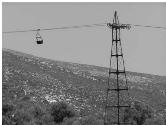
Fig. 1: A pylon and a bucket of “Enaerios”, the aerial system of emery transportation.

pyrite, sillimanite ( \text{Al}_2\text{SiO}_5 ), chlorite ( \text{Mg}_6\text{Si}_4\text{O}_{10}(\text{OH})_8 ), feldspars, apatite \text{Ca}_5(\text{PO}_4)_3(\text{OH},\text{F},\text{Cl}) , garnets (Nikolaou, 2005; Christofidis and Soldatos, 2009).