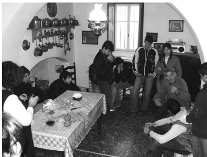
Fig. 5: Shootings during an interview with ex emery miners, in a traditional house of Apeiranthos.