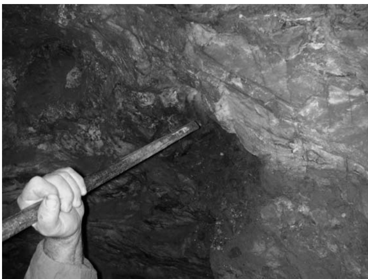
Fig. 3: Participation in a short mining procedure in a gallery near Apeiranthos.