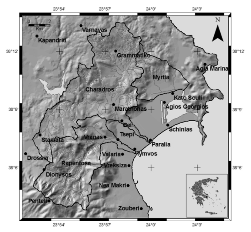
Fig. 1: Map showing the three catchments, the drainage network and the main settlements and landmarks. At the north east part of the map Myrtia borders with Charadros, which in turn borders with Rapentosa catchment from the south.