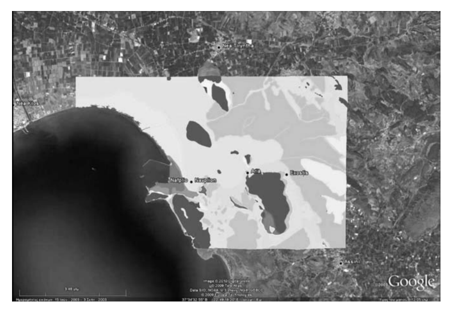
Fig. 5: Google Earth representation of geological formations from the broader area of Nafplio (Photiades, 2008).