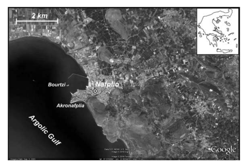
Fig. 1: Satellite image from Google Earth showing the location of the city of Nafplio and main topographic features of the broader area.

of studies, as well as reference point for possible future changes, ensuring the spatial and geological coherency of the entire data set (maps, borehole logs, geophysical measurements, etc). Furthermore, the interoperability of data banks at urban and national levels is a stake of prime importance for all providers of referenced geological data.