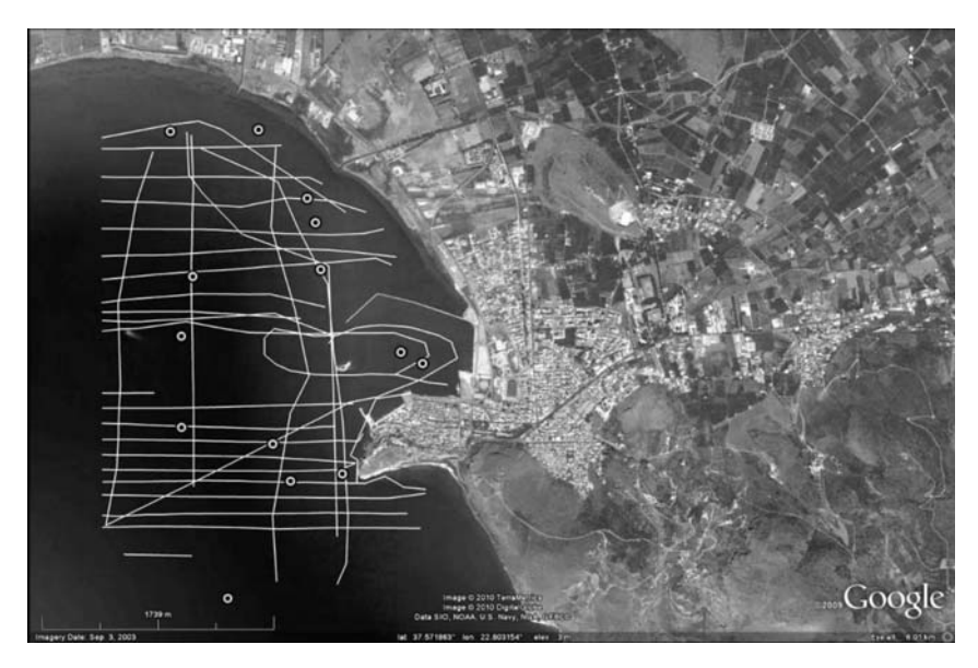
Fig. 7: Google Earth representation showing the location of seismic-reflection profiles and surface samples collected from the Argolic Gulf (Andrinopoulos et al., 2008).