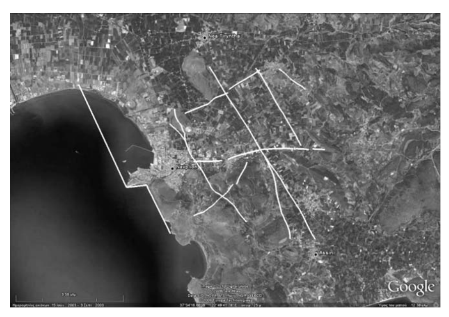
Fig. 6: Google Earth representation of neotectonic linear features from the broader area of Nafplio (Galanakis and Georgiou, 2008).

Fig. 5: Google Earth representation of geological formations from the broader area of Nafplio (Photiades, 2008).