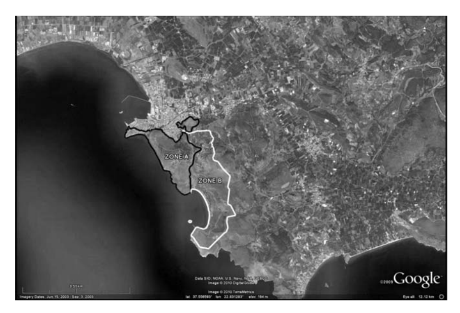
Fig. 8: Google earth representation of archaeological protection zones for the Nafplio area. Zone A corresponds to totally protected areas where no construction is allowed; Zone B encloses partially protected areas where conditional construction is allowed.

Through the Google Earth platform the derivative maps (geological, geotechnical, geochemical, geophysical etc.) and other digital data such as sampling points, elevation models, 2D - 3D digital surfaces are available and accessible to all, public or private sector or even general public, managing issues concerning the protection and enhancement of the urban and suburban environment.