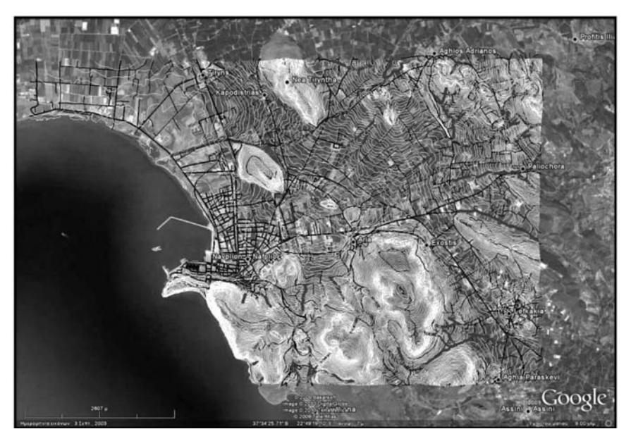
Fig. 4: Google Earth representation of topographic linear spatial features (contours, hydrological network, transportation network) from the broader area of Nafplio.

spatial measurements, and "tilting" of landscapes for enhanced 3D views. These tools are often sufficient to allow the non-GIS user to obtain specific information of interest from the data.