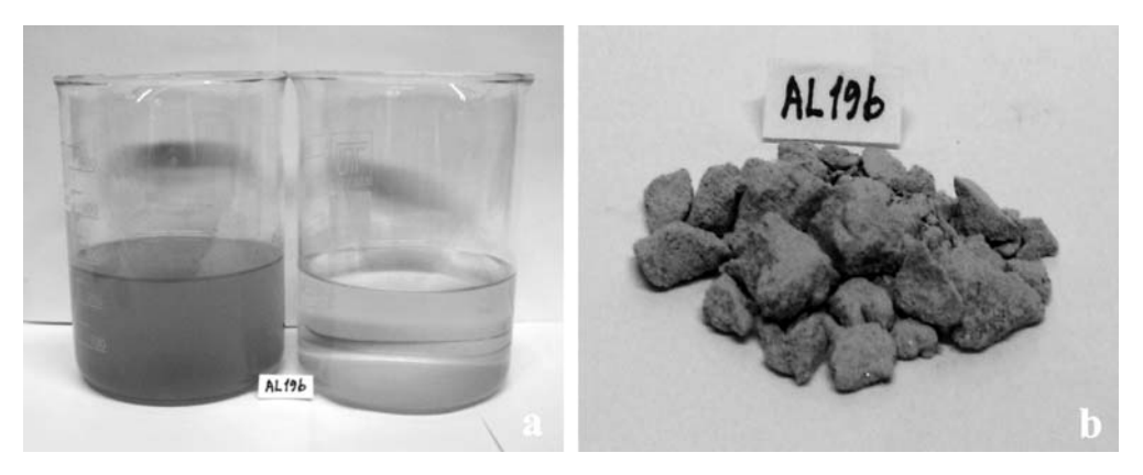
Fig. 3: a) Left: Starting urban wastewater (SUW), Right: Overflowed clear water (CW) after the HENAZE treatment. b) Odorless and cohesive zeo-sewage sludge, dried overnight at RT.