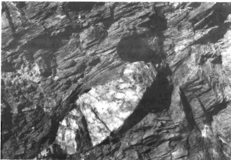
Fig.3: "Chocolate table" structures of quartz veins indicate deformation in the flattening field Ψηφιακή Βιβλιοθήκη Θεόφραστος - Τμήμα Γεωλογίας, Α.Π.Θ.