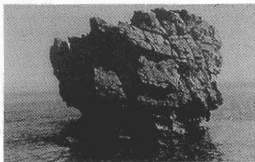
Fig. 2: The uplifted Late Holocene notch at Mylopotamos (Pelion). The vertex of the notch corresponds to a fossil sea-level, about 60cm higher than the active one.

In a few other sites, for example at the Stomion lighthouse (Fig. 1),