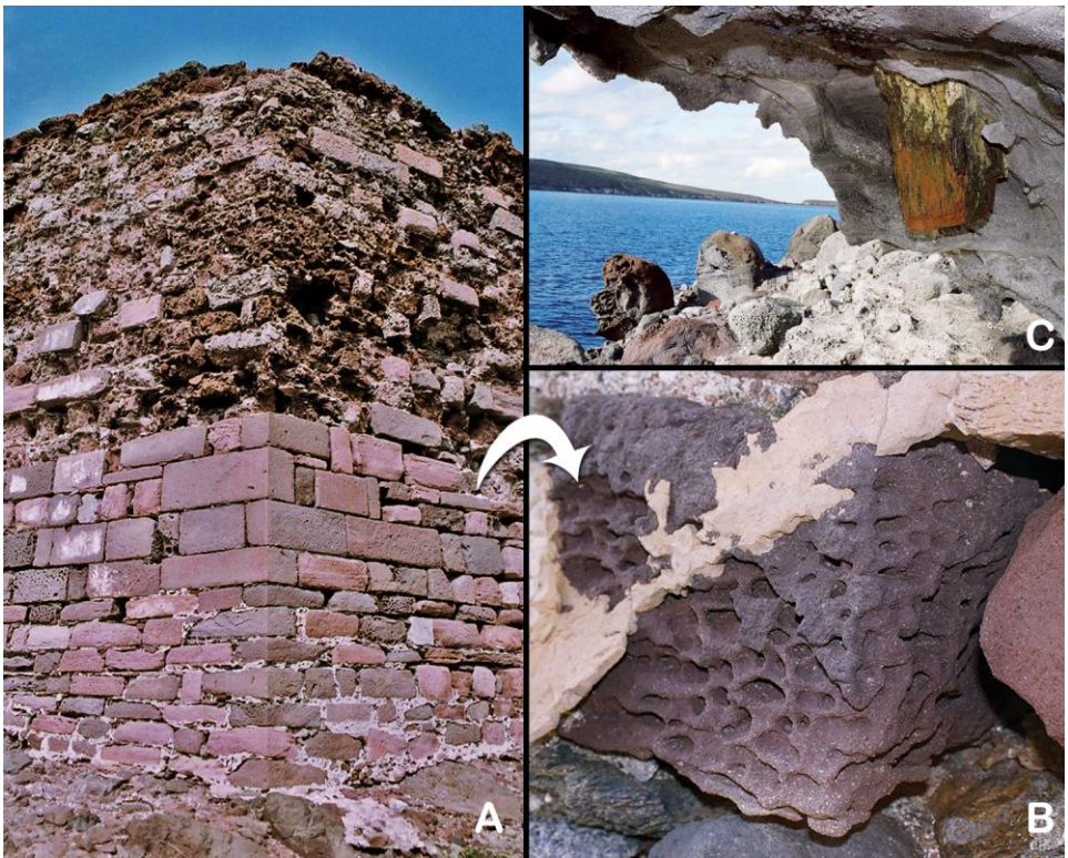
Fig. 5. A-B: tafoni formations from the Sigri Castle walls, figure C: a petrified trunk and tafoni on the same formation. A unique image of Geoparks comprehensive perspective.

A big boulder with tafone structures was found on the coastal area of the Plaka Park, 4.20 m above sea level. It has a large visor and the inside was almost eroded and removed. Just some merged in-