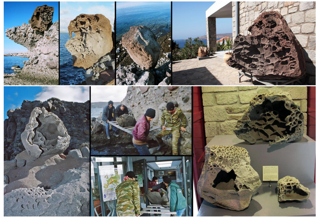
Fig. 6. Andesitic boulders with tafoni structures at the museum.

ner alveols and the outer crust remained over time. The vertical circumference was 1.8 m and the horizontal circumference was 2.20 m. The entrance was 50 cm in height, 65 cm in width and 40 cm in