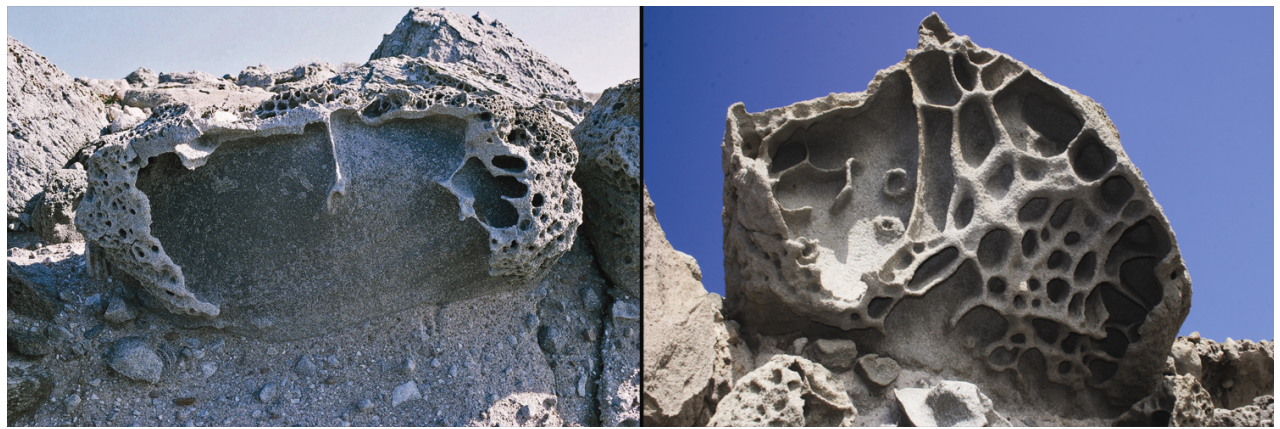
Fig. 3. Two characteristic tafoni formations on andesitic rocks on Plaka Park coastal geosite.

The Sigri castle was mostly build with local volcanic rocks which enabled to create a relative dating of the coastal tafoni and their development phases. The mesurements assumed 0.2 mm weathering per year for the coastal tafoni according to the size/date correlation of Sigri Castle wall tafoni.