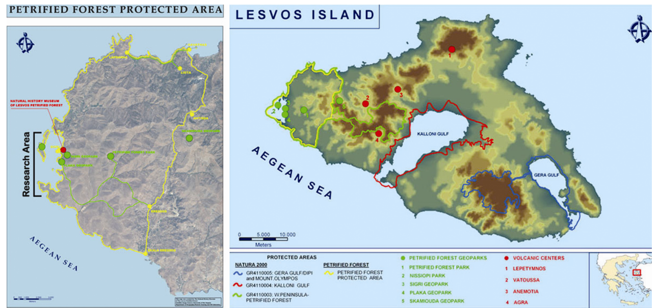
Fig. 1. Location map of research area and Lesvos Petrified Forest Geopark.

jected to this research were less than one meter in scale. As they represent different stages of cavernous weathering they are invaluable clues to understand the phases of erosion processes. The two of them shown below are characteristic samples of tafoni development on andesitic rocks (Fig. 3).