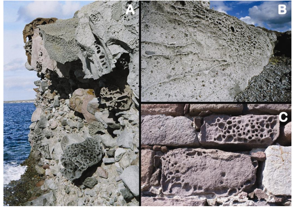
Fig. 4. Various tafoni distribution on the coastal geosite of Lesvos Petrified Forest Geopark (A: Andesitic boulders on cliffs, B: Coarse-grained pyroclastic layer, C: Sigri Castle wall).

vulnerability. Tafoni which developed on the pyroclastic cliffs were very unstable and continuously collapsing. Tafoni bearing andesitic boulders along the Sigri coast are much less solid than they seem. The pyroclastic formation including andesitic boulders which are in the range of the waves were continuously eroded before the tafoni complete their development phases. The erosion process results in falling or rolling of tafoni bearing rocks. Due to the inner cavities, micro scale decomposition caused by salt crystallization, dissolution and removal of the rock cement by capillarity mechanically weakens the rock. In order to protect some of the spectacular tafoni boulders were carried to the museum (Fig. 6).