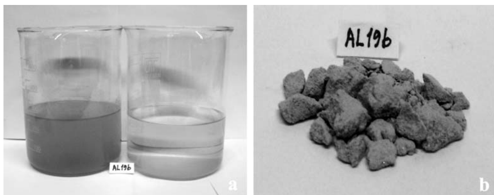
Fig. 3: a) Left: Starting urban wastewater (SUW), Right: Overflowed clear water (CW) after the HENAZE treatment. b) Odorless and cohesive zeo-sewage sludge, dried overnight at RT.